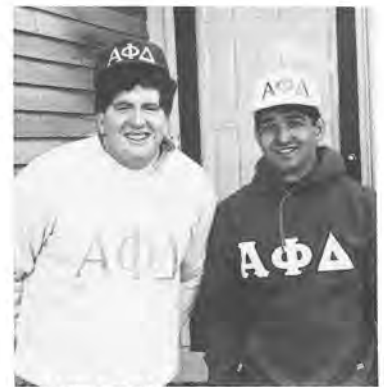
SWEATSHIRTS & CAPS