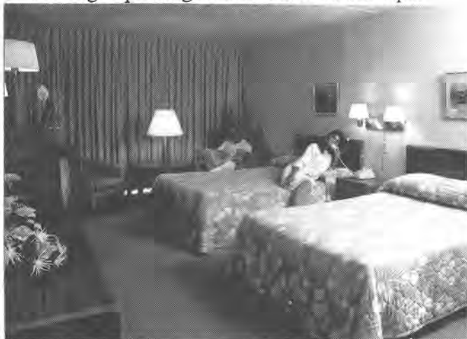
After a busy day of golf, sightseeing or water sports, rest in one of the Fernwood Resort's luxurious rooms.

Four night packages are as low as $295 per