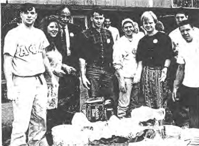
Gamma Pi, Ramapo College's Outstanding Greek Organization, were the only Greek organization to participate in the school's Waste Audit program.