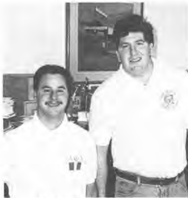
GOLF SHIRTS $15