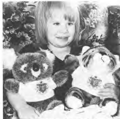
J. STUFFED ANIMALS $15 (TIGER ONLY)