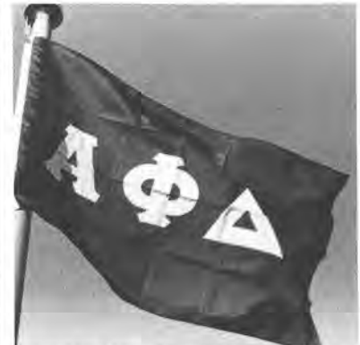
K. NEW! PURPLE AΦΔ FLAG $50