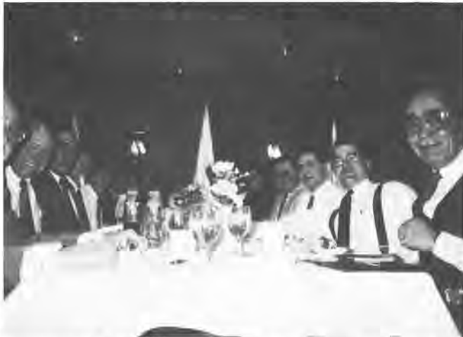
Pittsburgh area alumni enjoy their monthly meeting.