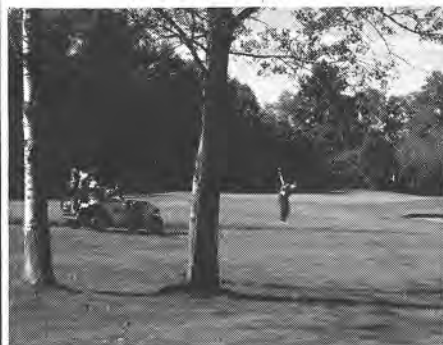
Summer Convention Nears