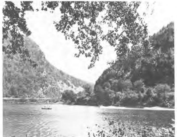
The Pocono Mountains provide a cool and restful retreat from the heat of the city during the Alpha Phi Delta Summer Convention, August 17-21.

person, and include breakfast and dinner daily, cocktail receptions on Monday and Thursday evenings, the annual AΦΔ Awards Banquet, use of the indoor and outdoor spas and swimming pools, gratuities and state tax. Children can enjoy the convention with their parents for as little as $30.